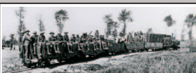
The P'tit train de la Haute Somme is an historic site of WW1, built by the allied armies to feed the front lines.